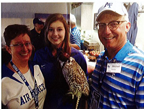
Go Air Force Falcons!